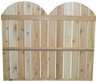
G) Love Seat Back