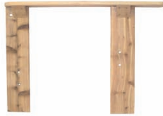
I-R) Right Love Seat Arm/Leg Section