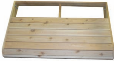
H) Love Seat Base