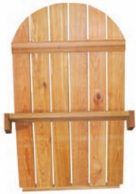
G) Chair Back