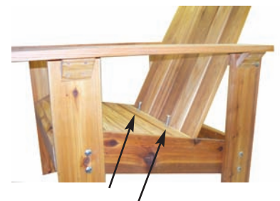
Assembled Cedar Deck Chair with Rounded Top