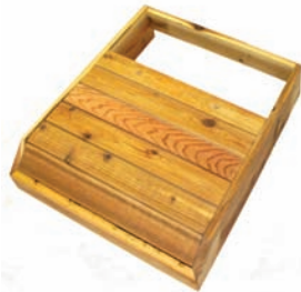
H) Chair Base