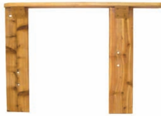
I-R) Right Chair Arm/Leg Section