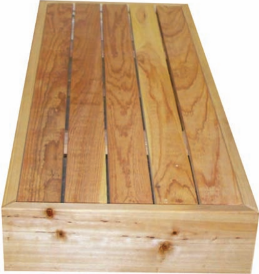
E) Bench Top (1)