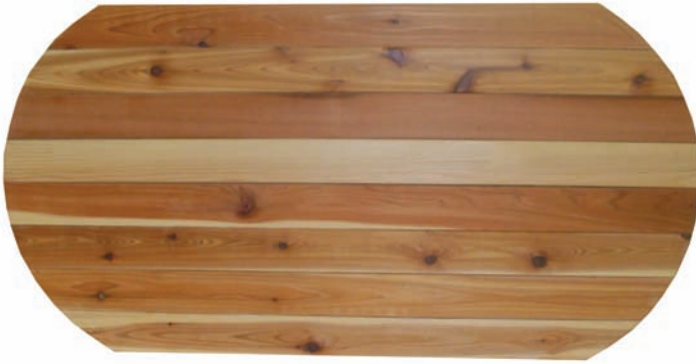
E) Table Top (1)