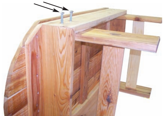
Assembled Rounded Cedar Table