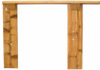
I-R) Right Chair Arm/Leg Section