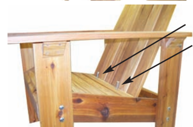
Assembled Cedar Deck Chair