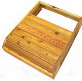
H) Chair Base