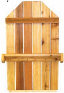
G) Chair Back